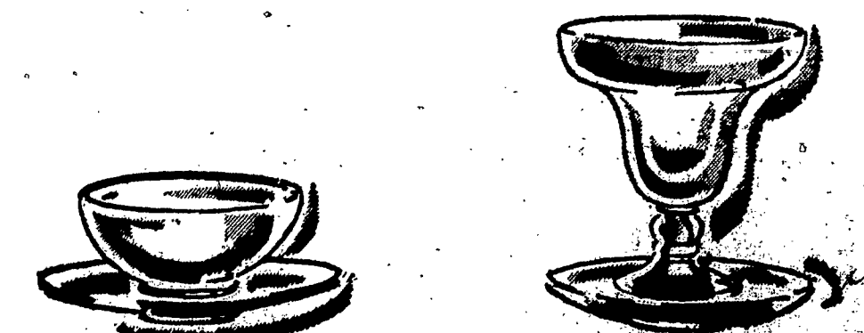
B. 16-piece salad-dessert set with 8 bowls and 8 matching plates 6.50