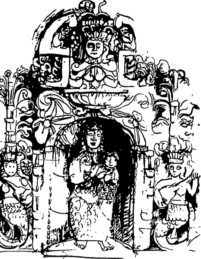
'Missa Criolla' jacket cover features this design of Madonna and Child, typical of sculpture adorning many of the outdoor shrines in Argentina.

"This 'Missa Criolla' is a synthesis and an invitation. It opens its arms for mankind, saying: 'Come to the Church with everything that is in your flesh and in your blood: with your culture and your rhythms, with your forms of expression and your landscapes. Thus, let folklore come to the Church and with it, man and his earth. The Word is within each man. The Word expresses itself through the beat of his guitars, his bagualas, his 'carnavillos.' To Him—the Church has to be faithful. Him it should be looking out always.'" (Catholic Entertainment Features)