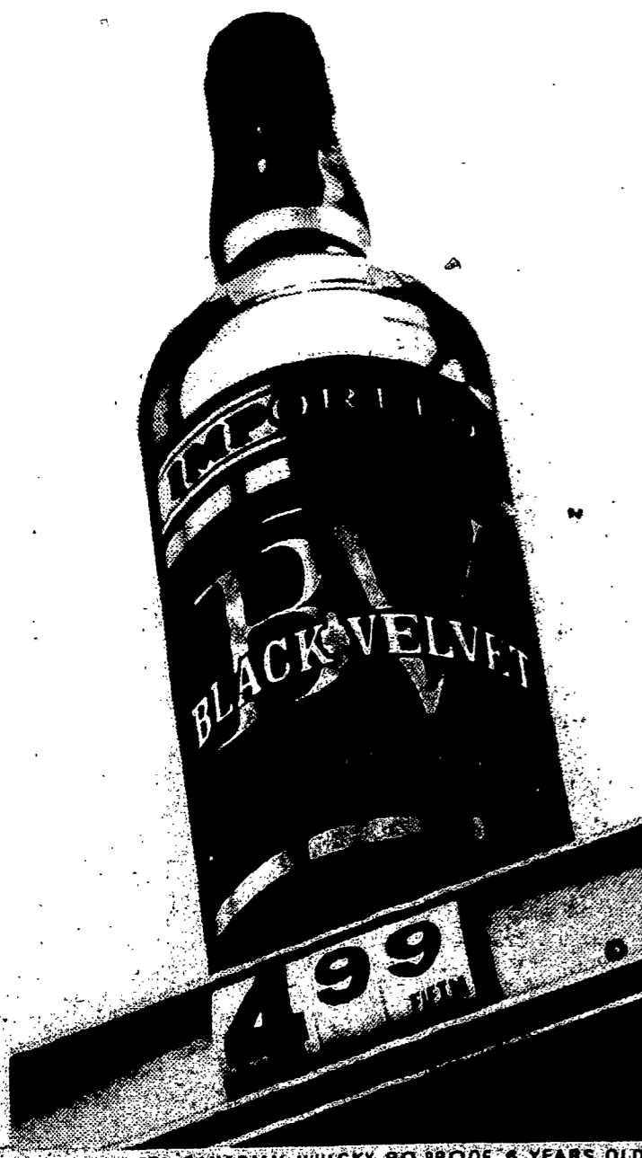
BLACK VELVET® CANADIAN WHISKY, 80 PROOF, 6 YEARS OLD. IMPORTED BY HEUBLEIN, INC., HARTFORD, CONNECTICUT.

Easy! It's imported in bulk to save you about $1.00 a bottle in tax and shipping. It's bottled here, but the whisky (like the taste) is all Canadian.