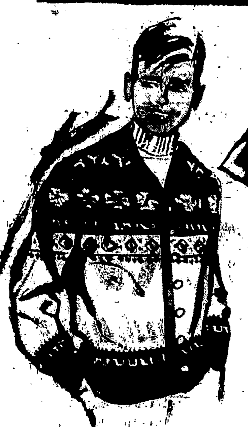
boys' sweaters plain 'n fancy! $5.90 reg. 9.00