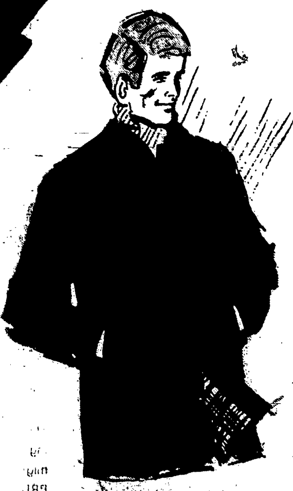
boys' all-weather coat best buy for dress-up $12.90 reg. 19.00

His favorite sweater is here! Solid colors! Ski patterns! Stripes! Wools! Orions! Wool-mohair blends! V-necks! Crew necks! Coat models! All colors. 8 to 20.