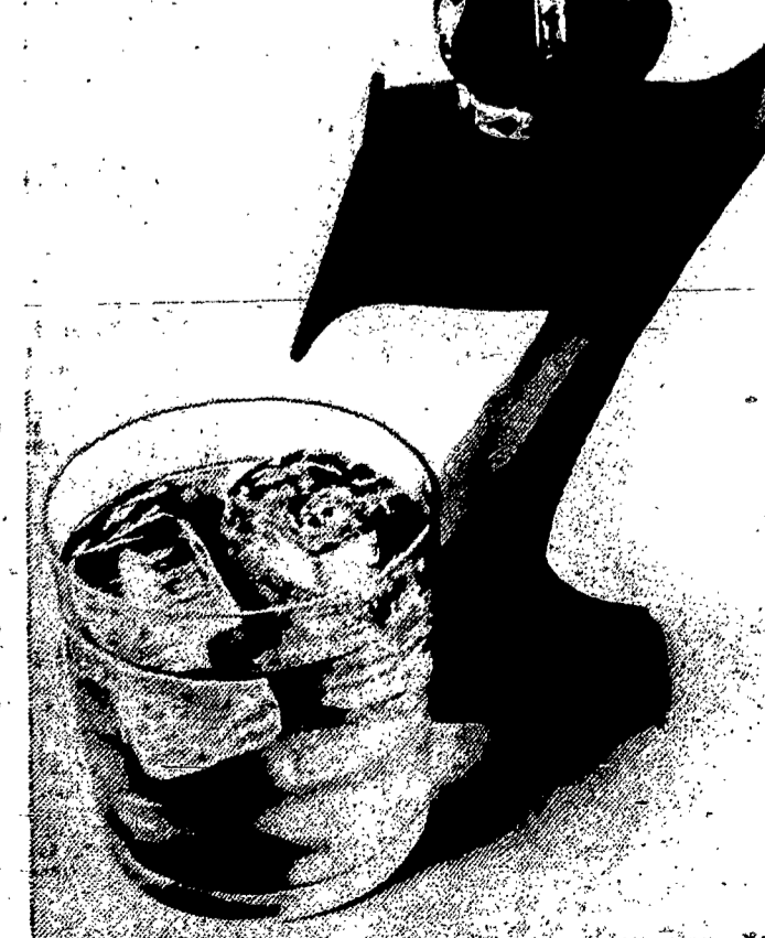
SEAGRAM BOTTLED CO., N.Y.C., BLENDED WHISKEY, 50 PROOF, 65% GRAIN NEUTRAL SPIRITS.