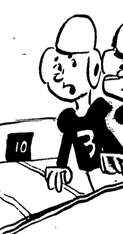
THE HOME T