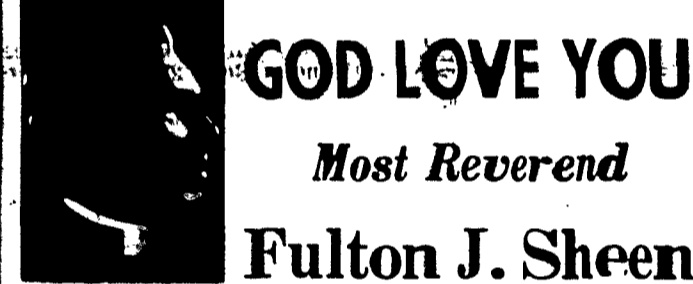
GOD LOVE YOU Most Reverend Fulton J. Sheen