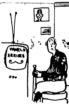
"What a lovely day. Come in, of course not interrupting a"