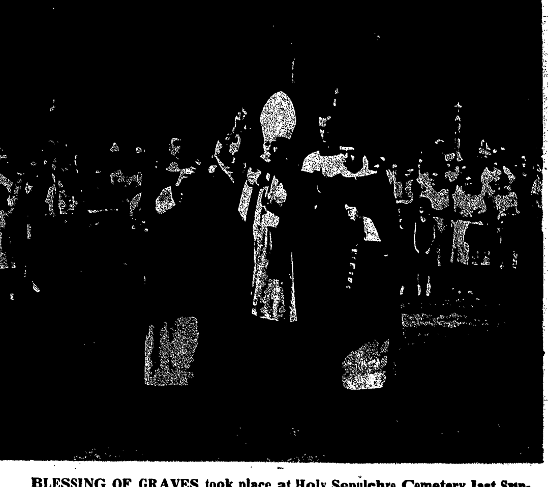
BLESSING OF GRAVES took place at Holy Sepulchre Cemetery last Sunday. Bishop Kearney is shown incensing the cemetery in the traditional rite.