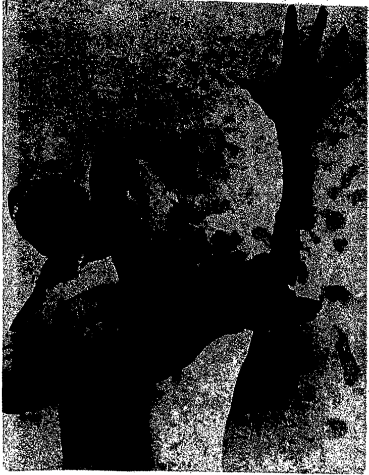
Aquinas Quarterback, Craig Englerth