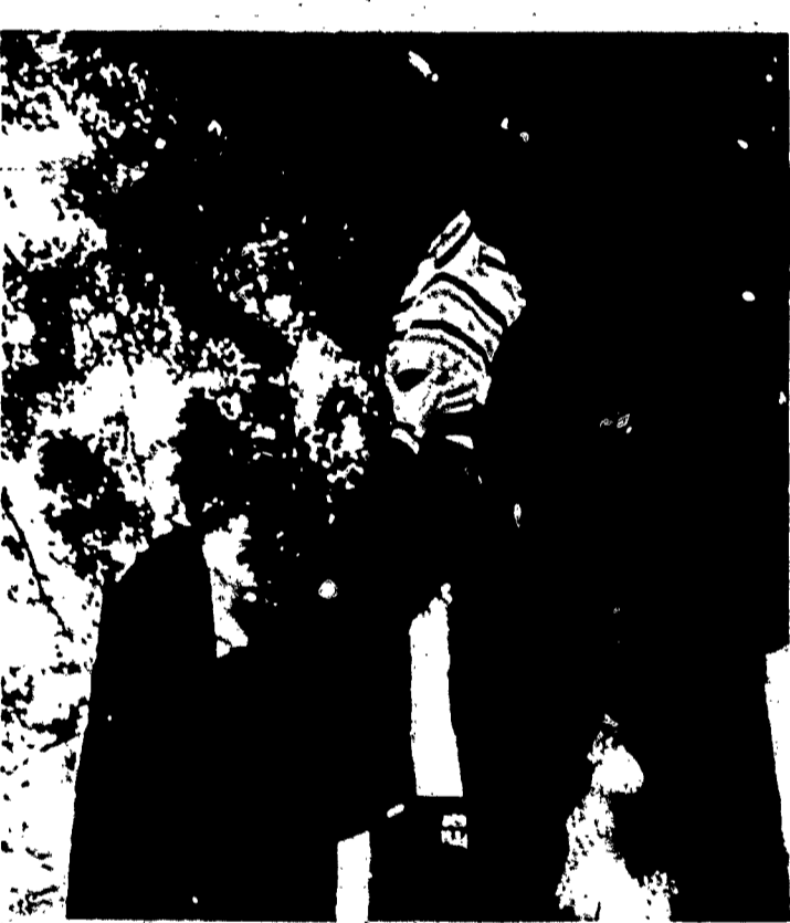
... They roller skated like crazy ...

• 375 MAIN ST. E. • PITTSFORD PLAZA • NORTHGATE PLAZA 232-5727 DU 1-1860 NO 3-2120