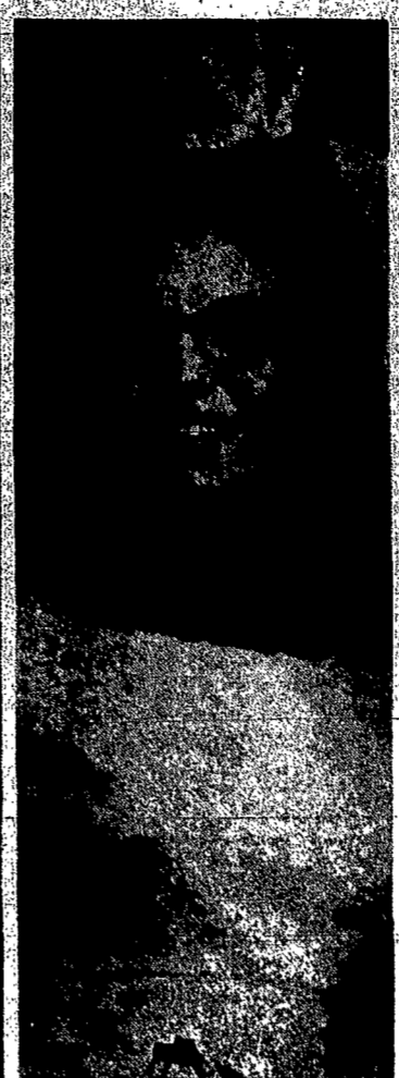
MRS. CHARLES DAY