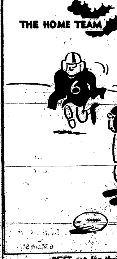
"GET set for their hidden-ball play."

REPRESENTING ALLIED VAN LINES Inc. No. 1 on U.S. Highway No. 1 in Service No. 1 in your community