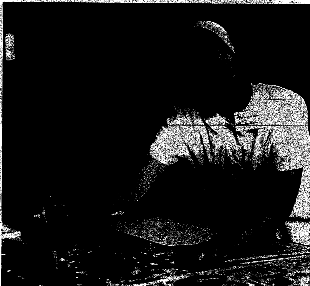
Maureen Wheelahan starts to apply oils to her charcoal sketch.