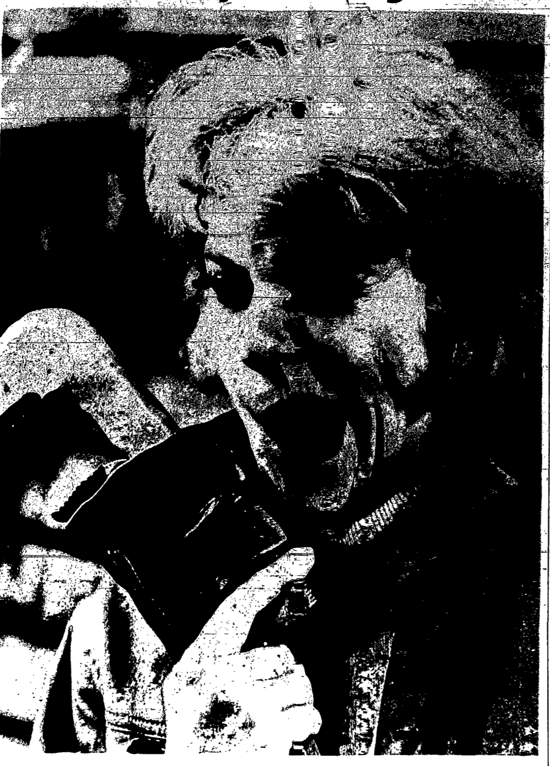
Karen Morrow sings in "I Had a Ball."