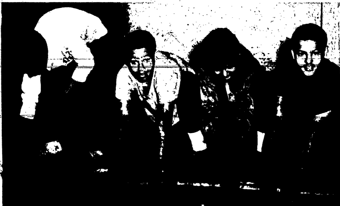
Tearing up the floor at De Porres center... first step to getting a new one.