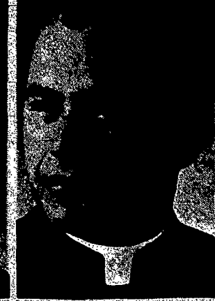
Father Helman Becker Hall