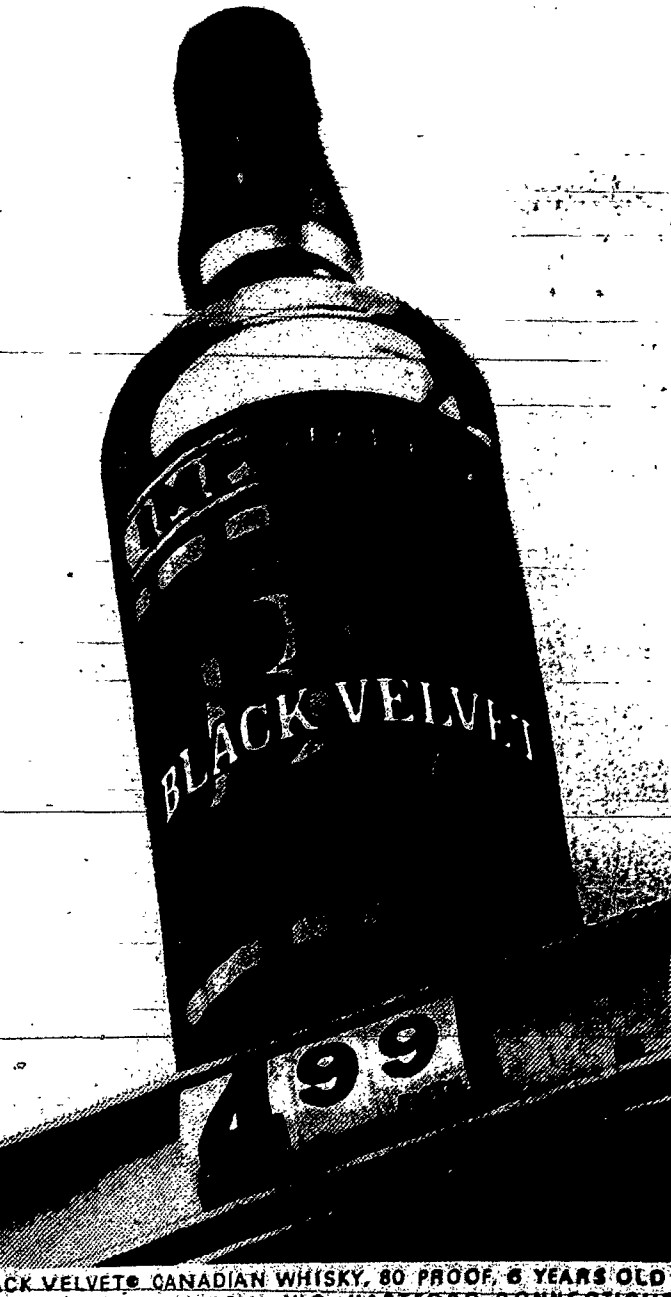
BLACK VELVETS CANADIAN WHISKY, 80 PROOF, 6 YEARS OLD

Easy! It's imported in bulk to save you about $1.00 a bottle in tax and shipping. It's bottled here, but the taste is all canadian.