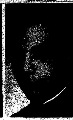
Father Valente Mercy High