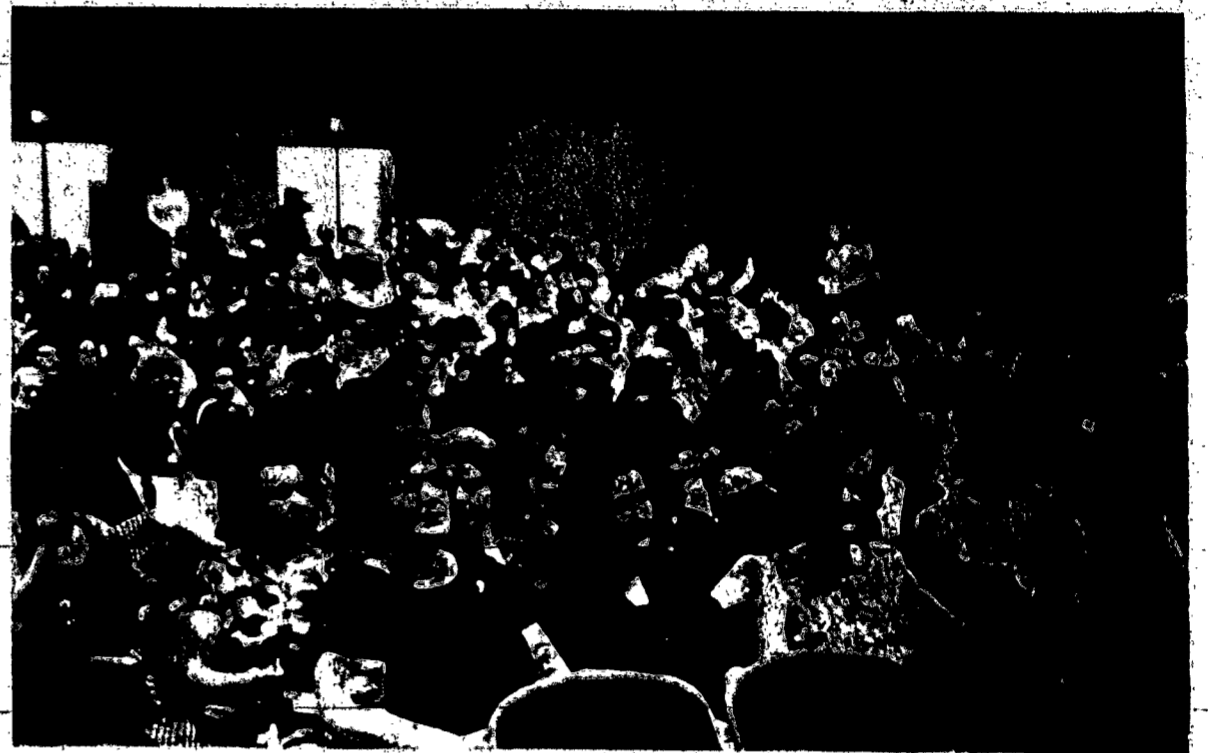
Census workers get their instructions at a briefing session in Cardinal Mooney High School auditorium. Schedule of other sessions is listed on page two.

Meat, therefore, may be eaten as on any other day.