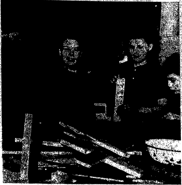
Craftsmen at St. Joseph's Villa.

Eight agencies of Rochester Catholic Charities share in Community Chest funds to provide around the year services to youngsters, married couples and the aging. The Chest-Red Cross annual fund drive is currently in progress. Photos show some of the projects which will be continued if the drive is again its usual success.