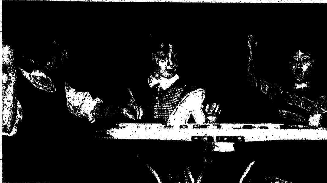
Settlement house game after school.