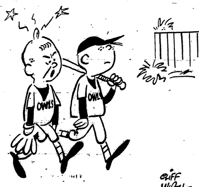
"You'd think I was the only guy who ever lost a pop fly in the sun!"