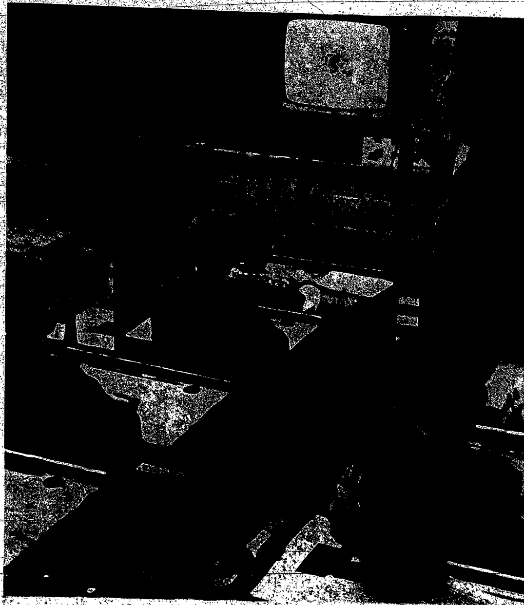
Morton, Ill. —(RNS)— Eighth grade pupils at Blessed Sacrament School in Morton view a taped color TV lesson transmitted by 2,500 megacycle microwave from Bradley University in Peoria, 15 miles away. The telecast marked the first color educational TV transmission on a 2,500 MC microwave. Initial broadcasts also were seen in the university's student center by some 100 school superintendents, business executives and educational leaders. Bradley has been a leader in the development of regional educational TV using microwave transmission, which costs less than UHF broadcasts.