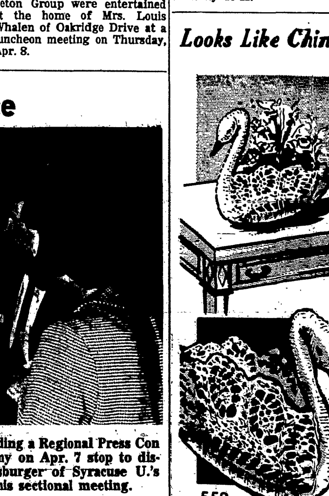
552 Fill this unique centerpiece with flowers, fruit—a hostess or shower gift. Graceful on table, perfect! Crochet swan centerpiece of heavy jiffy cotton with pink, apple border. Starch stiff. Pattern 552; directors.