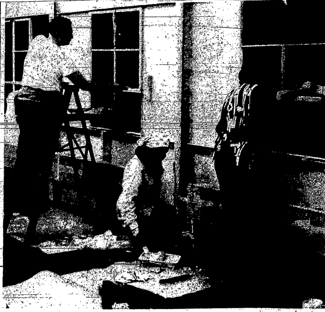
Parishioners of Mother of Sorrows Church, Greece, paint the inside of the grotto hut, which doubles as a chapel. It was damaged by fire on Feb. 17.