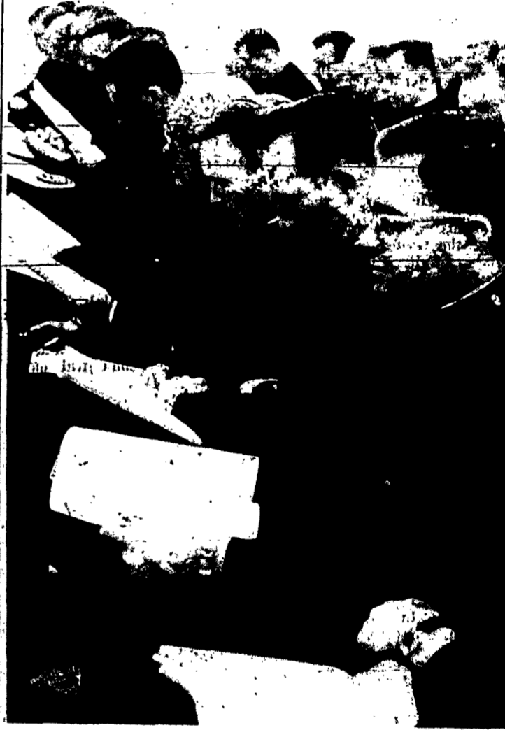
Parish priests study intently census forms to be used to bring diocesan statistics up to date.