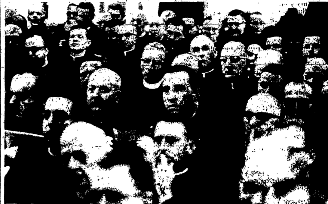
Priests of the Diocese attended meetings at Auburn, Elmira and Rochester to hear details of census planned for late this spring. Find your parish priest in the picture; tell him you saw him in the Courier.