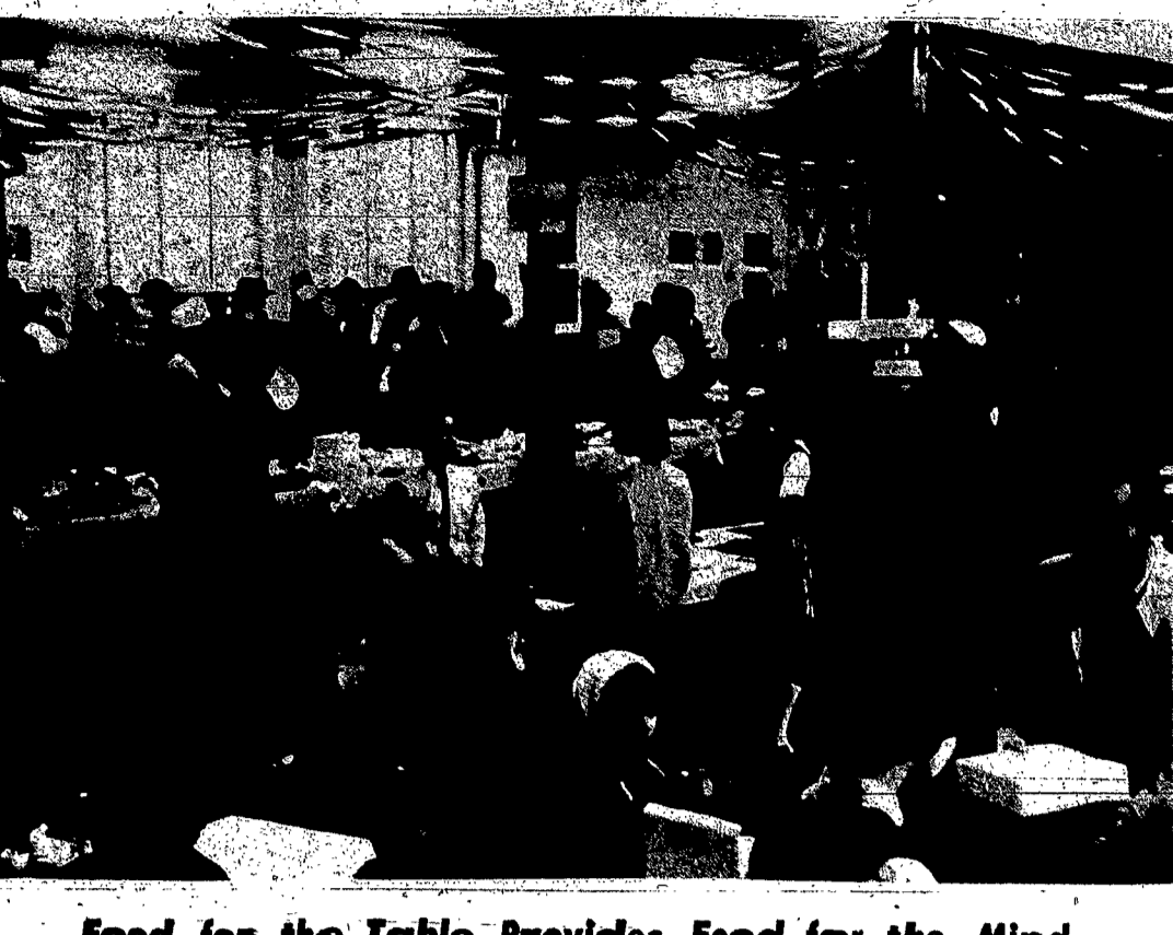
Food for the Table Provides Food for the Mind

The festival, which is sponsored by the New York State Music Association, is open to soloists and ensembles up to sixteen persons. Qualified judges from all over New York State will rate the performances.