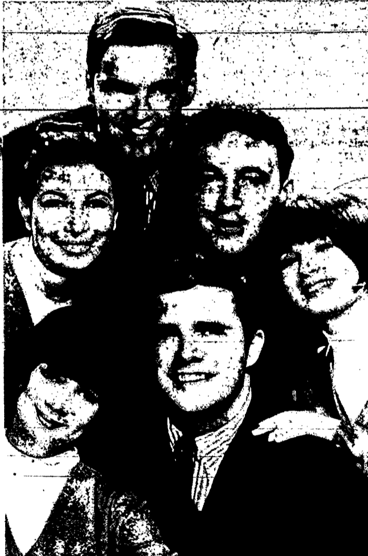
THE BITTER END SINGERS

What really surprised me was that she was only 17 years old. Here is an artist that seems to have reached the peak of her career, yet she has a long time to reach out for greater heights. And she is also a very talented writer, as well. Among the tunes in this album that she has written or adapted are So Early in the Spring, Le Roi, Lovin'