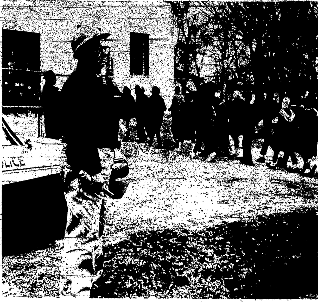
Selma police herd children to jail.