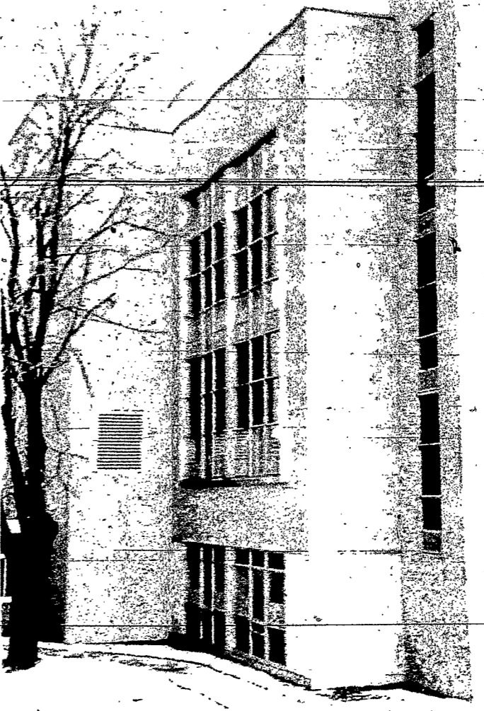
Exterior of Bishop Kearney Educational Building.

The nursing school was opened in 1892 with the students spending an 11-hour day and no vacation periods. The present three year program covers a wide variety of nursing and related subjects. There are 107 students enrolled with Sister Victoria as director.