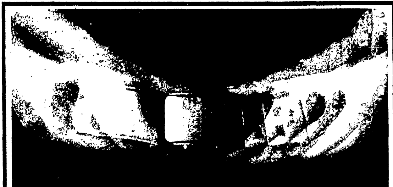
It takes 6 1/2 seconds to fasten a seat belt