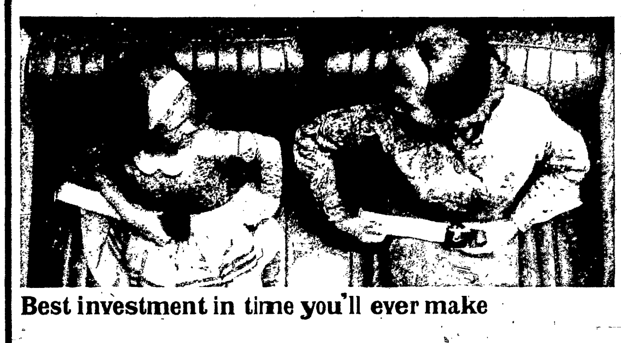
Best investment in time you'll ever make

6 1/2 seconds could save your life. Or prevent serious injury. That's all the time it takes to pick up a seat belt... and fasten it. If everyone did this—every time—the National Safety Council says at least 5,000 lives could be saved each year, and serious injuries reduced by one-third. Here's a simple reminder for you and your passengers the next time you drive—"Buckle your seat belt, please." Published to save lives in cooperation with The Advertising Council and the National Safety Council