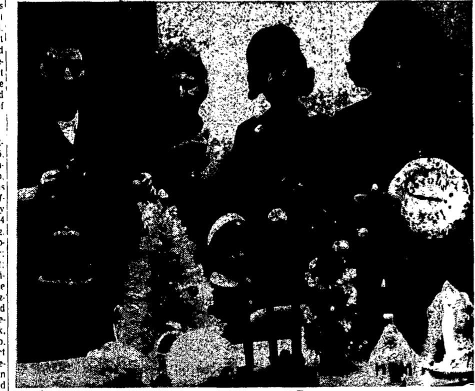
St. Stanislaus Ladies show articles from their recent Christmas Sale.

Gentle before. Even gentler now. Made with choice whiskeys blended with finest grain ne... Pours from a new gentle-shape bottle. Feels good to the hand. Treat your drinks gently with Partners Choice. $6.99 Quart