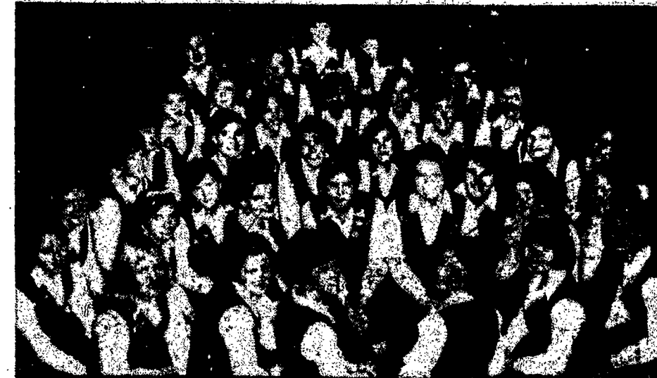
MISTER STEPHEN is set for the Mercy High stage this weekend. Cast and chorus for the two-act musical are shown above.

MULTI-KESSLER COMPANY, LAWRENCEVILLE, GEORGIA. BLENDED WHISKEY. 48 PROOF. 75% GRAIN NEUTRAL SPIRITS.