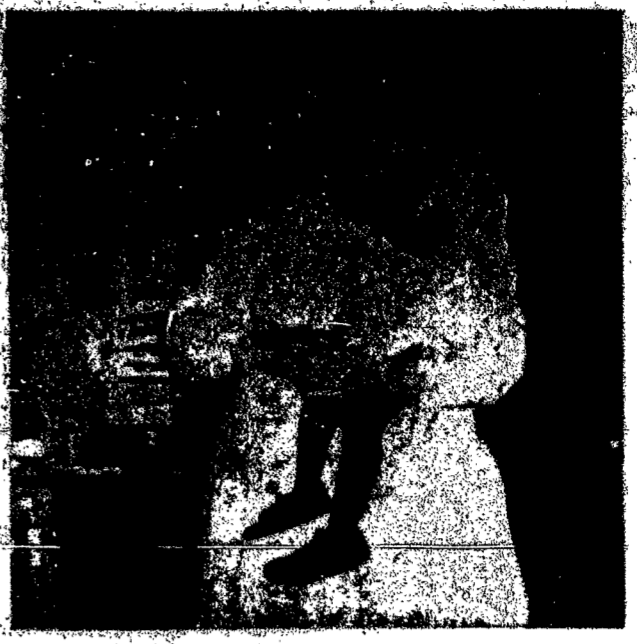
SISTER ALWAYS HAS TIME to give a "lift" to one of the children.