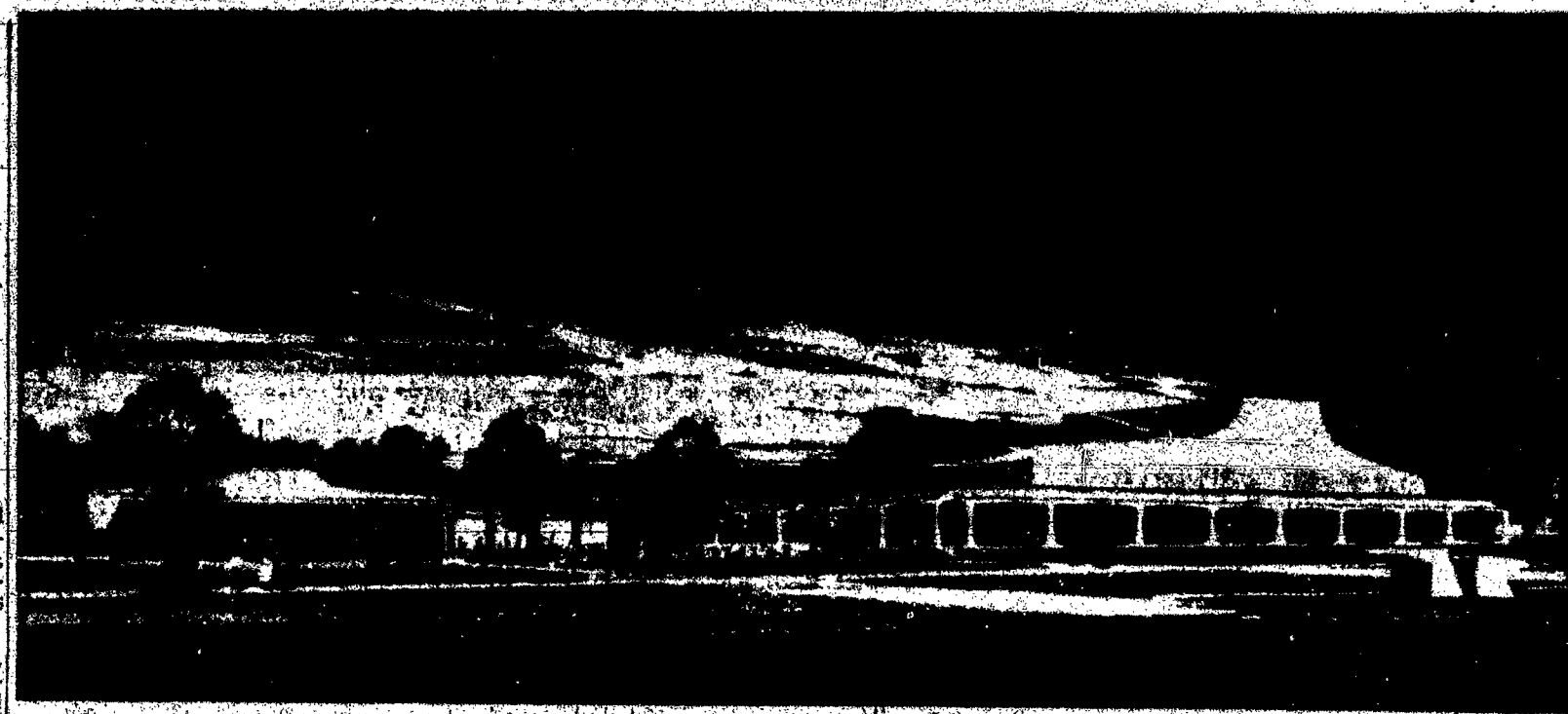
Architect's rendering of the proposed Arts Center on Nazareth College campus.

Construction of the 35,000 square-foot Arts Center is scheduled to begin next spring and will be completed by 1967. The complex will include an auditorium, lecture halls for general academic use, and wings for