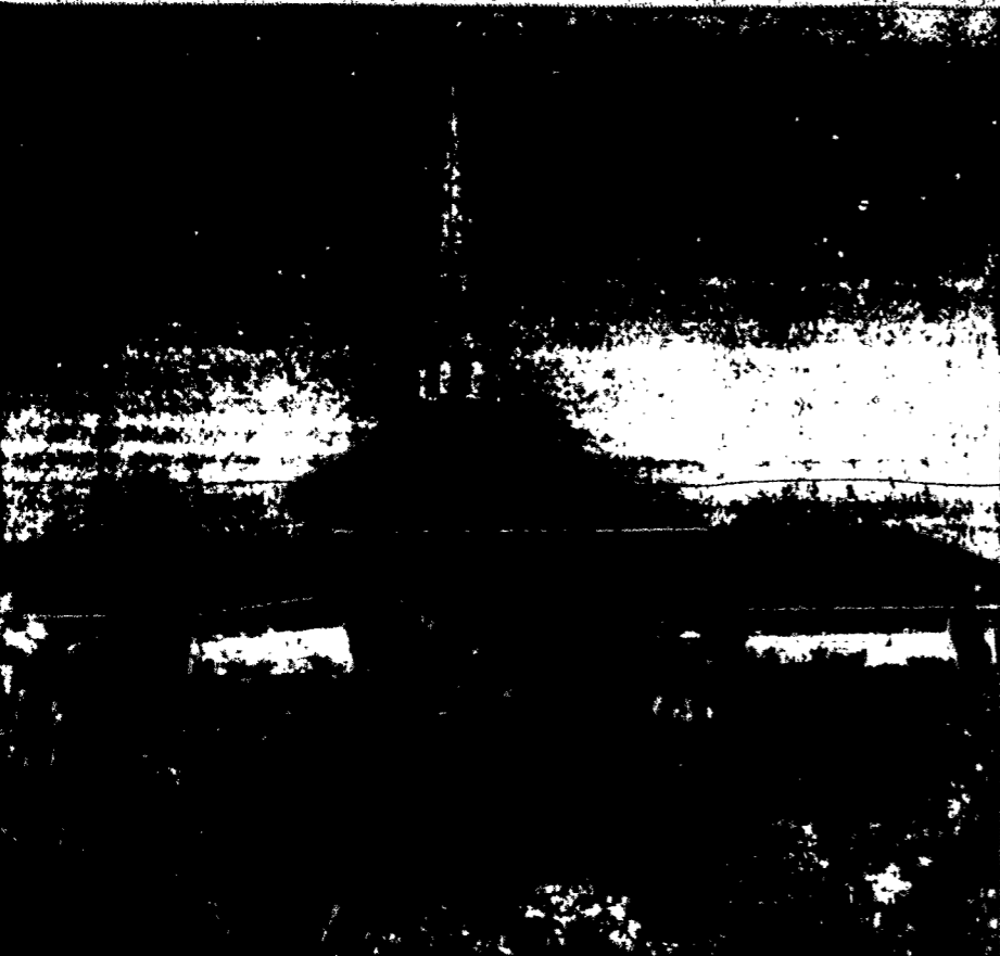
A CAMERA FAN is seen taking a photo of the monks enjoying a light lunch last Saturday on the occasion of Open House at Mount Saviour Monastery, Elmira. The Monastery grounds were thronged with visitors from the Southern Tier and Pennsylvania areas inspecting the newly erected building. Looming high in the background is the Chapel of Our Lady Queen of Peace.