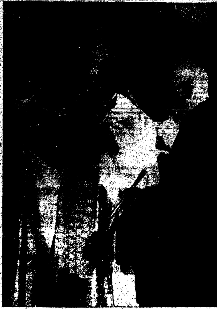
Open House at Mount Saviour