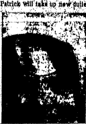
SISTER MARY PATRICK

WAVEBLY, N.Y. Marston Cleaners 413 Broad Street For Odorless Cleaning SHIRT LAUNDRY IN 2-2848 CLARK'S SUPERETTE A Flamingo Place To Visit The place will serve hot food of the highest quality. In the center of the building, there is a bar.