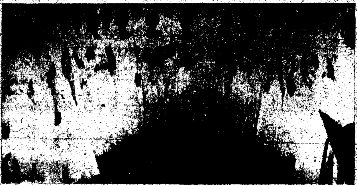
Brides of Christ, representing 18 parishes, are shown prior to their reception in the Sisters of St. Joseph.