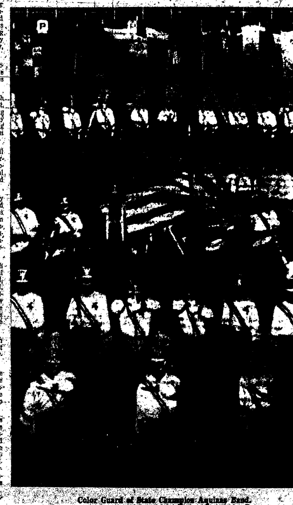
Color Guard at State Champion Aquinas Band.