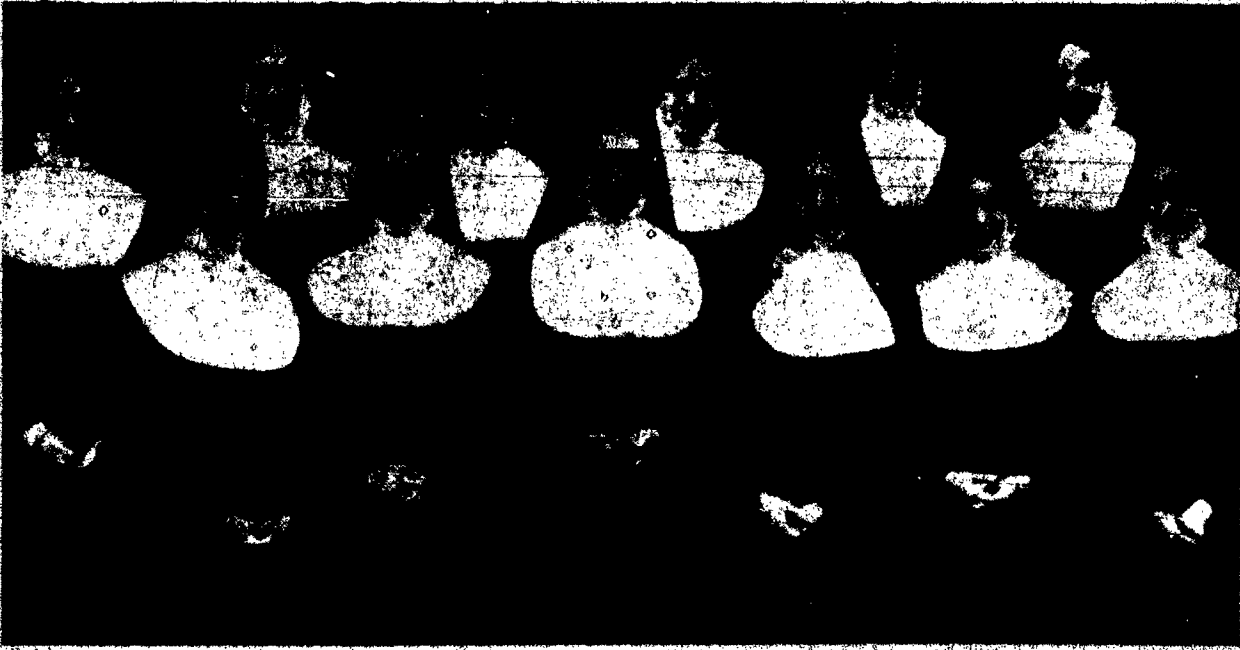
New novices received their veil in the Sisters of St. Joseph last Saturday.