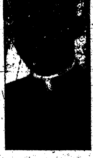
FATHER BIEBER leap at the snake only to find a four-year-old boy pulling the carcass of the dead snake around the house with the aid of a rope.

Fearing for the occupants of the house he immediately made his escape.