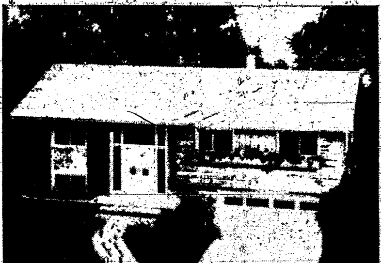
Be sure and ask for your free copies of "The House of New Dimensions" by Pittsburgh Plate Glass Company and "What To Do About Windows" a guide to window decorating by Julie Sherman, N.S.I.D.

The public is invited to attend this colorful event.