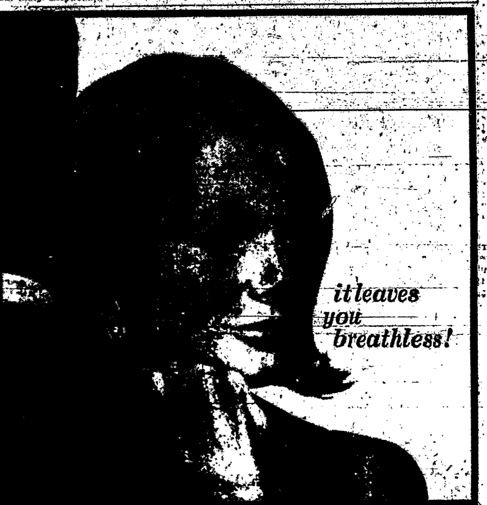
it leaves you breathless!

American Express Travel Agency Genesee Bldg., Main & Genesee Sts., Buffalo (TL 6-7373)