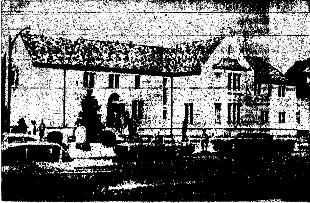
Exterior of new Cathedral administration building