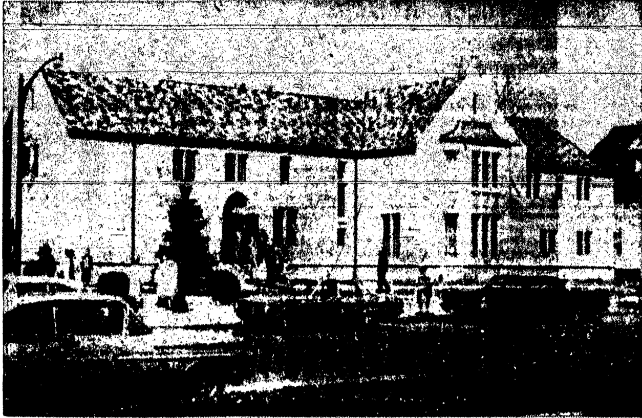
Exterior of new Cathedral administration building