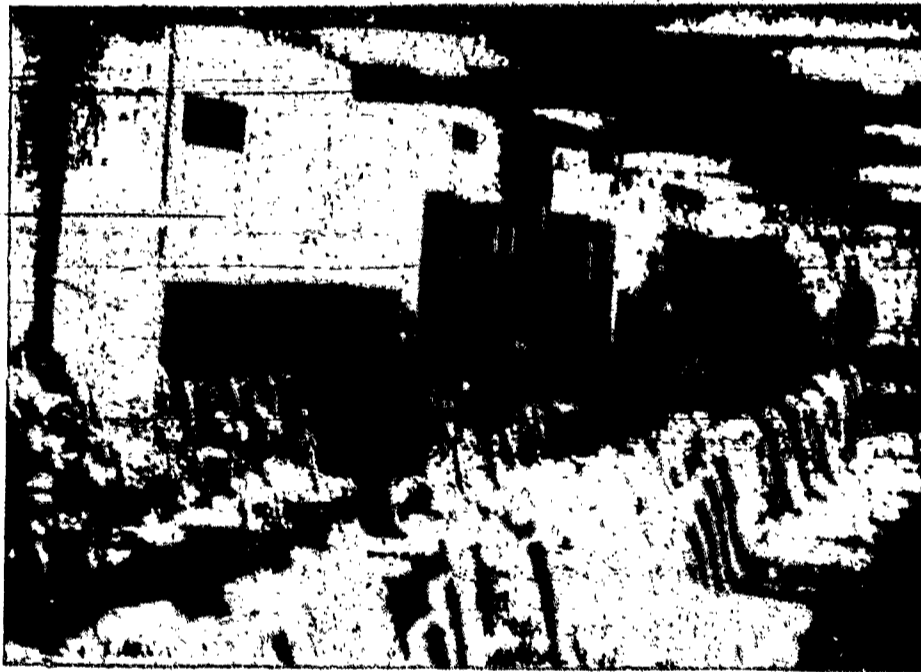
Parish hall for 300.