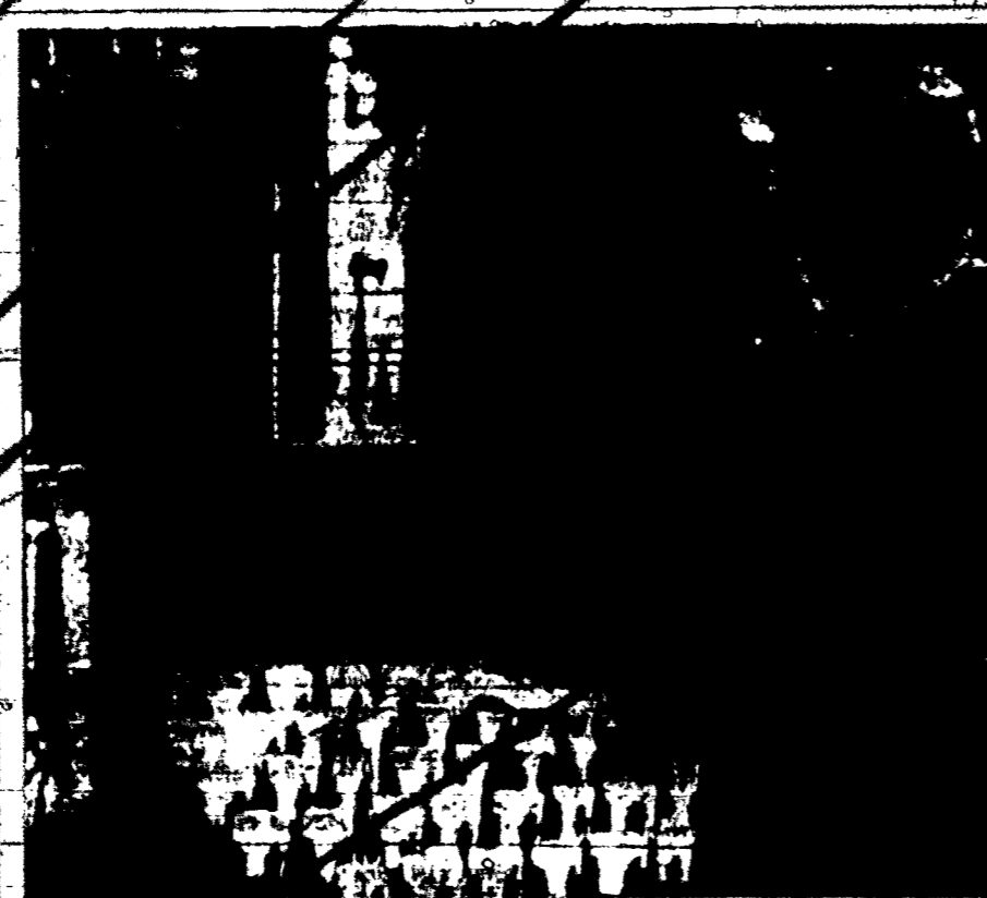
A Candle at The Cathedral New York — (RNS) — Stage and screen star Van Johnson is shown lighting a candle in St. Patrick's Cathedral in token of gratitude after a recent operation had shown no recurrence of the cancer removed from his thigh a year ago. The actor, a Protestant, lit the candle in fulfillment of a vow he made on hearing the good news from his doctors.