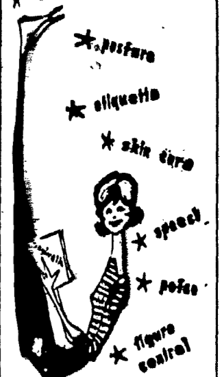
NANCY TAYLOR STUDIO division of ROCHESTER BUSINESS INSTITUTE