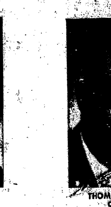
THOMAS J. FENLON County Clerk

ACTION . . . to prevent the construction of a coal-loader in the port of Rochester, contaminating air and water. ACTION . . . Against a "grab" of your sales tax dollar by greedy Republican Supervisors. ACTION . . . for more street improvements, more traffic lights. ACTION . . . and an end to wasteful, spendthrift Republican county government. ACTION . . . Against the politically-inspired "Weighted-Vote", which is rigged against YOU! VOTE DEMOCRATIC VOTE ROW 'B' ALL THE WAY . . . and pull LEVER 16, top of machine