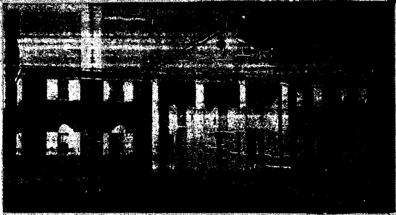
Exterior of the new St. John the Evangelist Convent, Spencerport.

COURTESY OF THE SISTERS OF ST. JOHN THE EVANGELIST CONVENT, SPENCERPORT