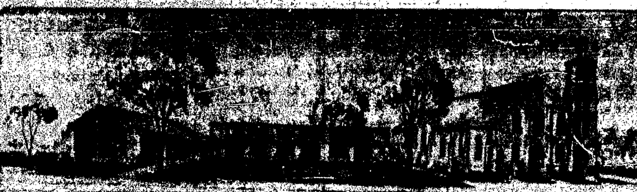
Artist's concept of St. Mary's Hall, School and Church in Bath after completion of the school addition.

St. James, Waverly; Veterans' Administration, Bath.