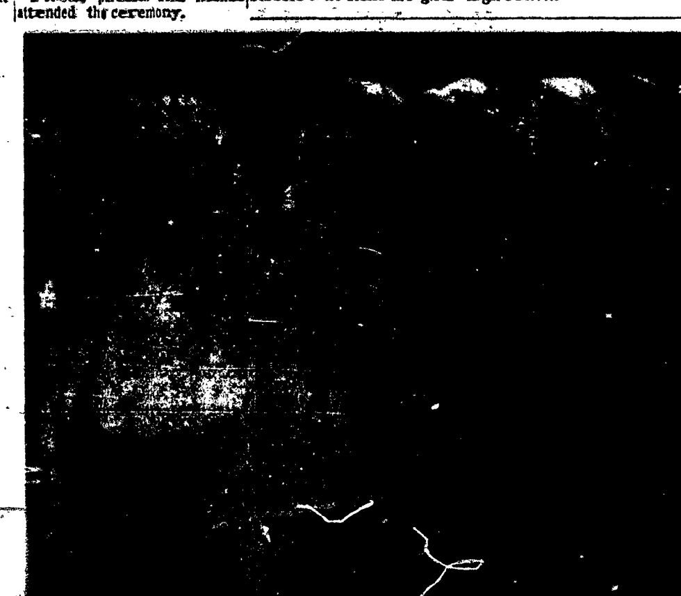
Young white rolled novices talk flin your as the area of Mercy in selecte carestonias at the Blooms Boad Noth charge.