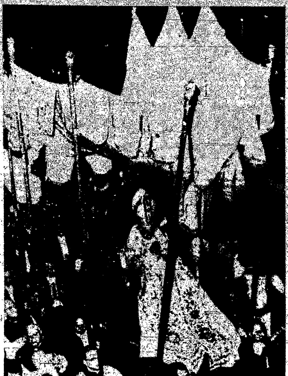
Pope John presided at Vatican rites which proclaimed U.S. born nun, Mother Elizabeth Ann Seton, a 'blessed' in heaven.