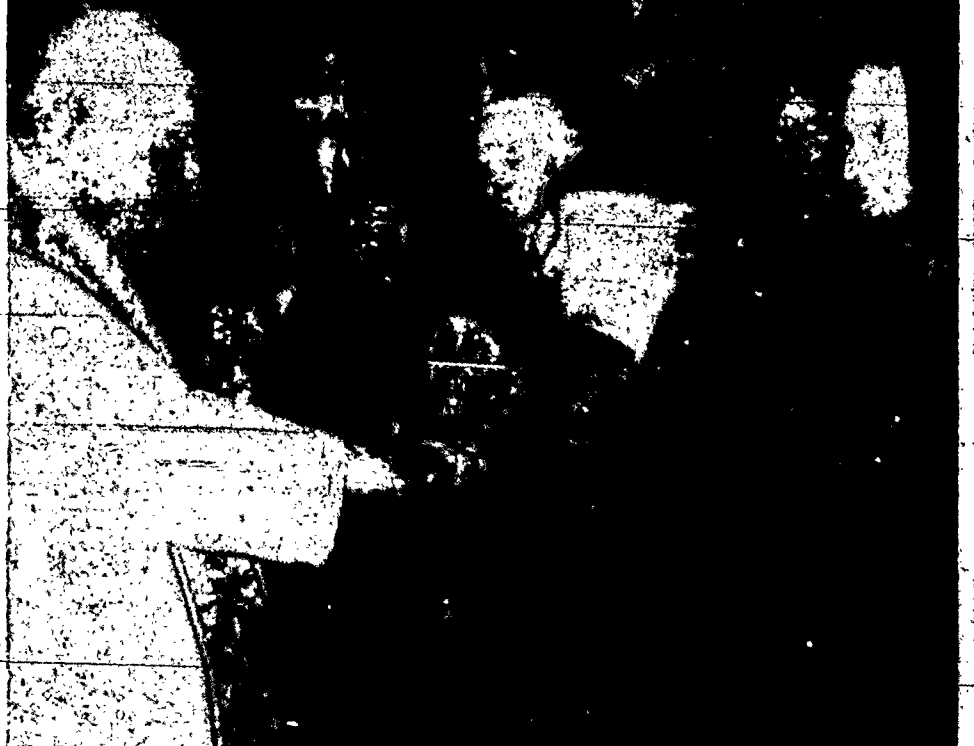
He called himself a 'youngster' when he greeted a group all of whom were over 90 years of age.