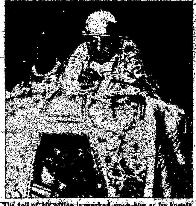
The toll of his office is marked upon him as he kneels to open the ecumenical Council at the Vatican.