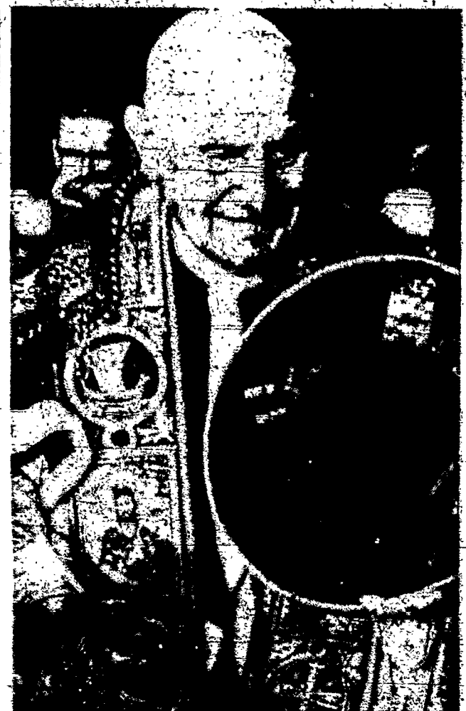
The ship, symbol of the Church he ruled, and St. John the Baptist, the saint he sought to imitate, are on the stole Pope John wore.