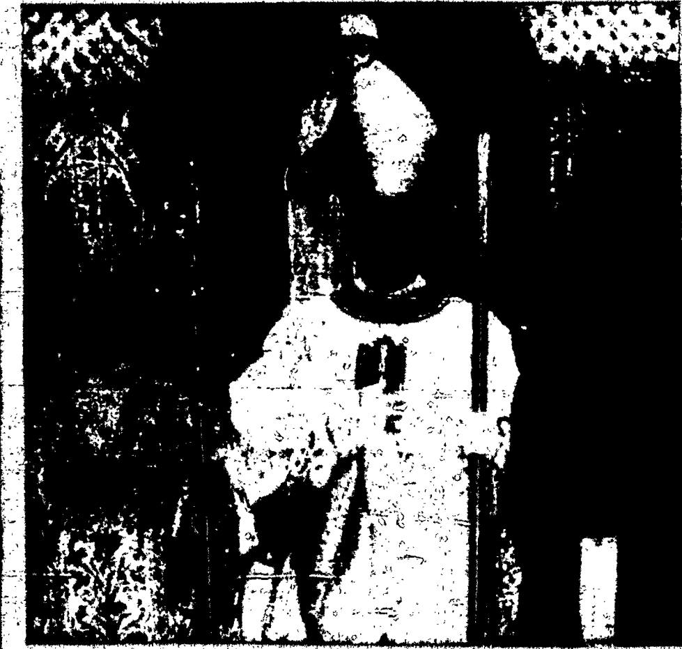
Consecration rite on May 5, 1953, brought Cardinal Spellman of New York to Rochester's Sacred Heart Cathedral.

Certainly a high-point of his ten years in the episcopate was his attendance at the Vatican Council this past autumn. Like all the other 2,500 Catholic bishops in St. Peter's Basilica, he was stirred by the presence of Pope John XXIII. His talks about the Council to many groups reveal a deep per-