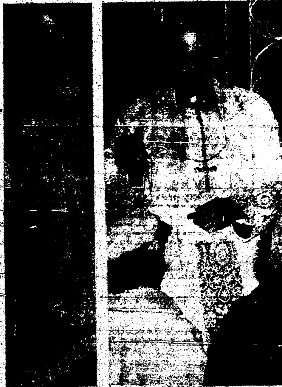
A blessing for a young mother.