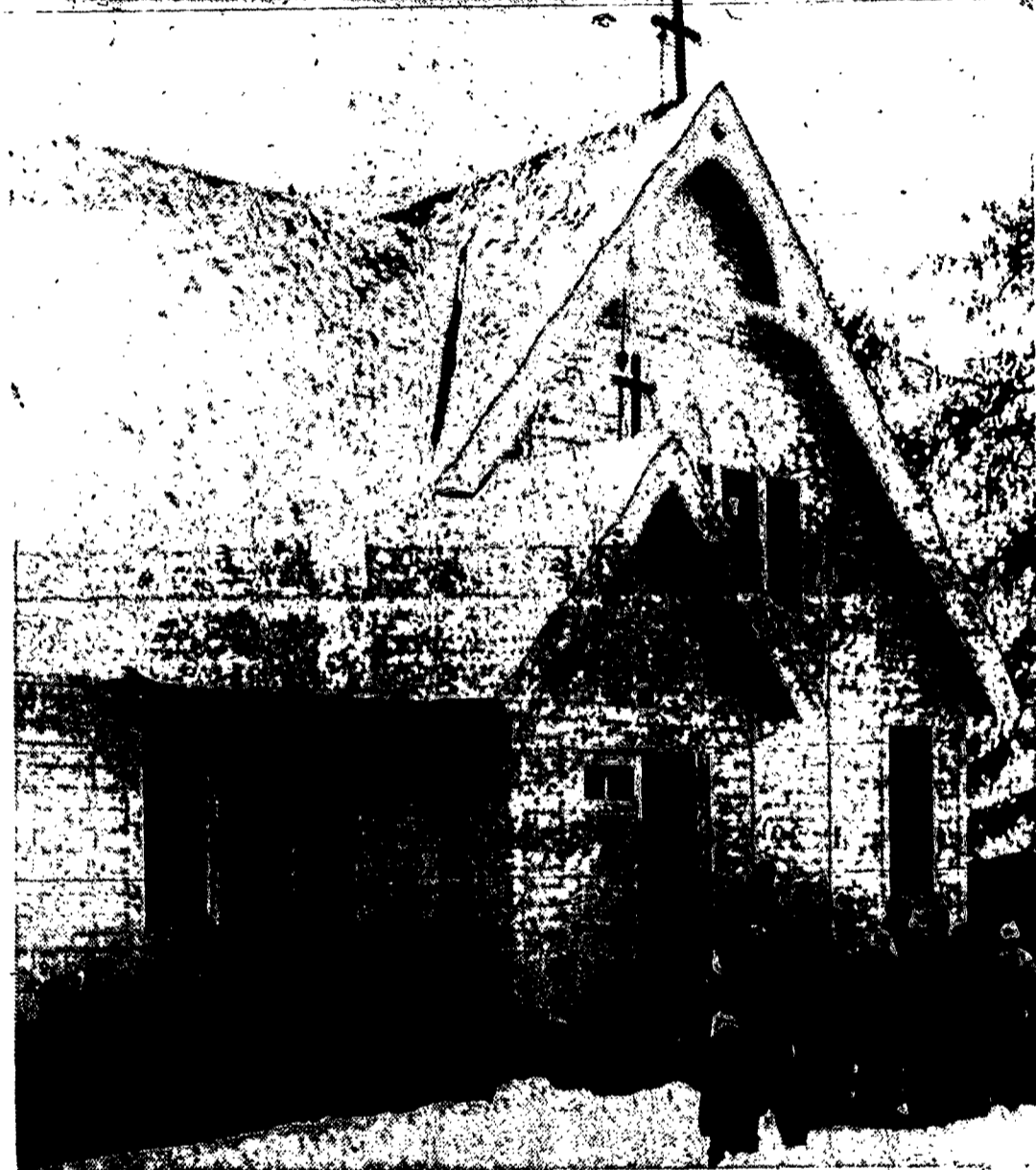
Parishioners, though few, are a staunchly loyal group at Owasco church.

Monuments and Markers for Holy Sepulchre. The better way to choose a monument is to see our indoor display. You will appreciate our no-agent plan. TROTT BROS., 1120 MT. HOPE, GE 33271. Adv.