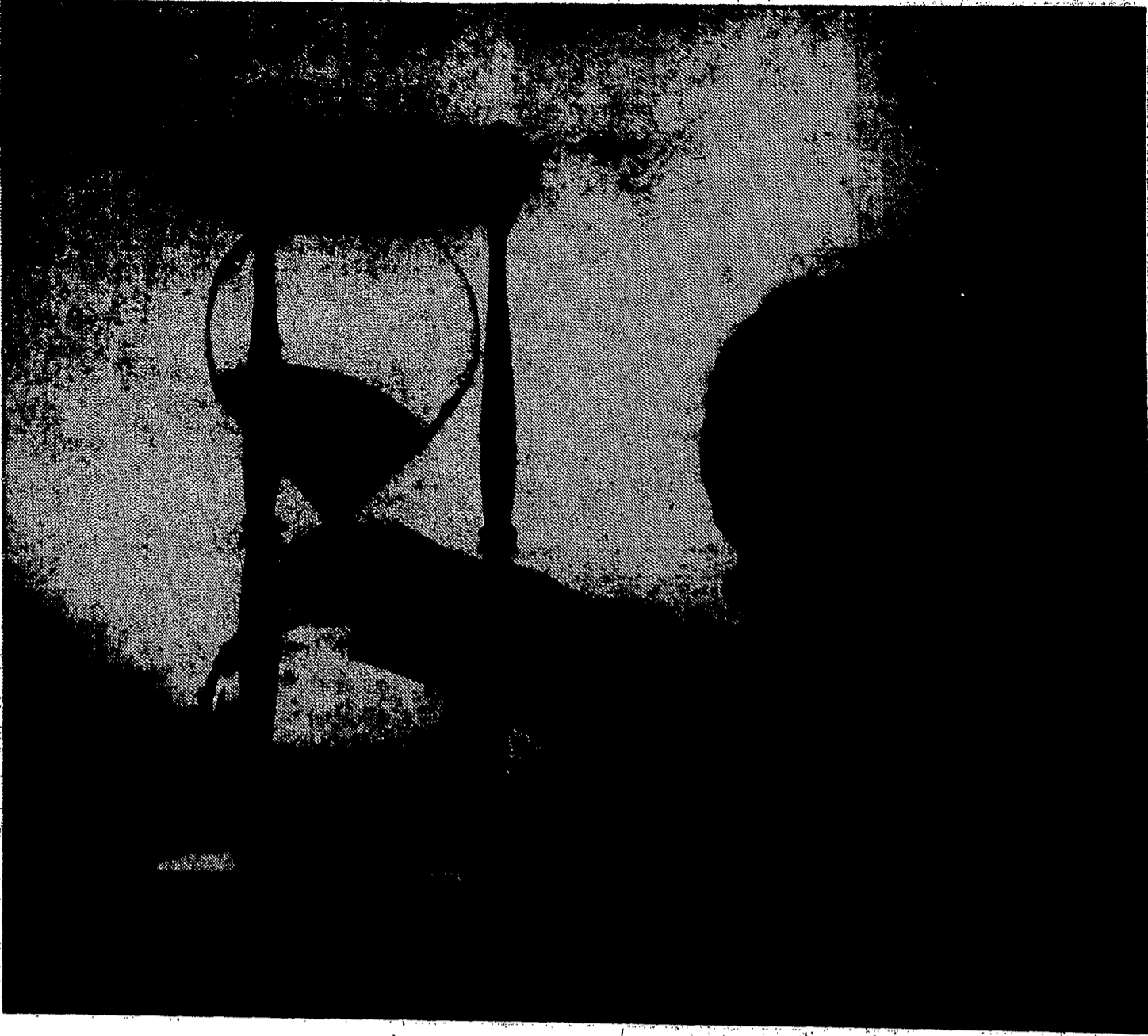
Another Day, Another Year

74th Year ROCHESTER, N. Y., FRIDAY, DECEMBER 28, 1962 PRICE 10 CENTS