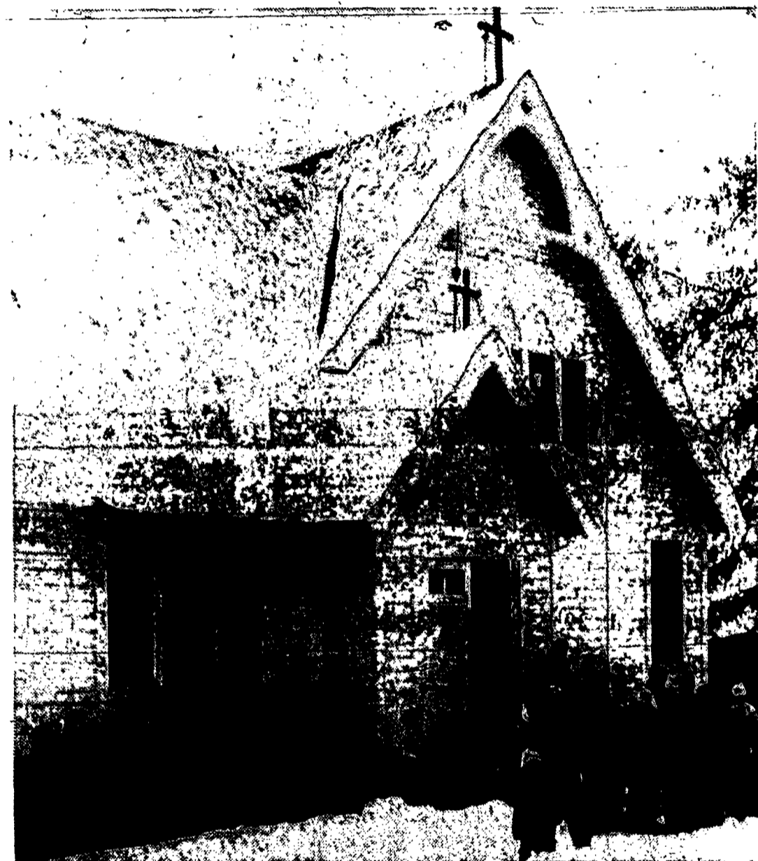
Parishioners, though few, are a staunchly loyal group at Owasco church.

Monuments and Markers for Holy Sepulchre. The better way to choose a monument is to see our indoor display. You will appreciate our no-agent plan. TROTT BROS., 1120 MT. HOPE, GR 33271. Adv.