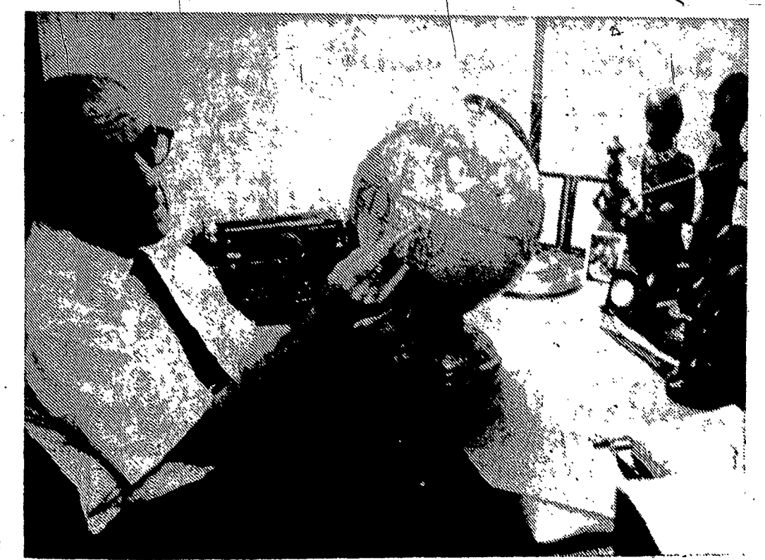
"I'll be almost on the equator."