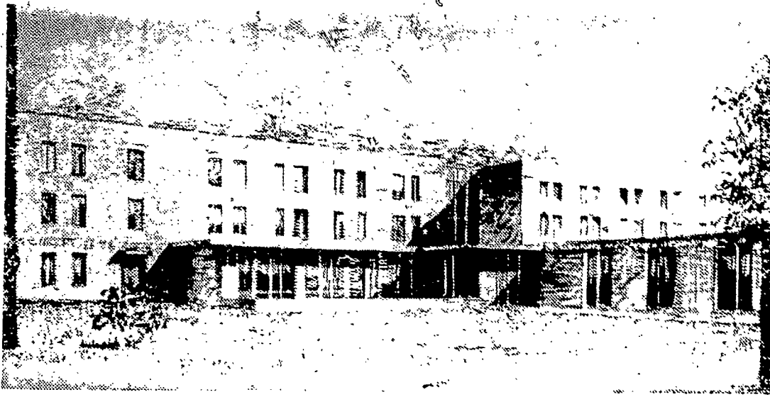
Proposed new dormitory at Nazareth College.